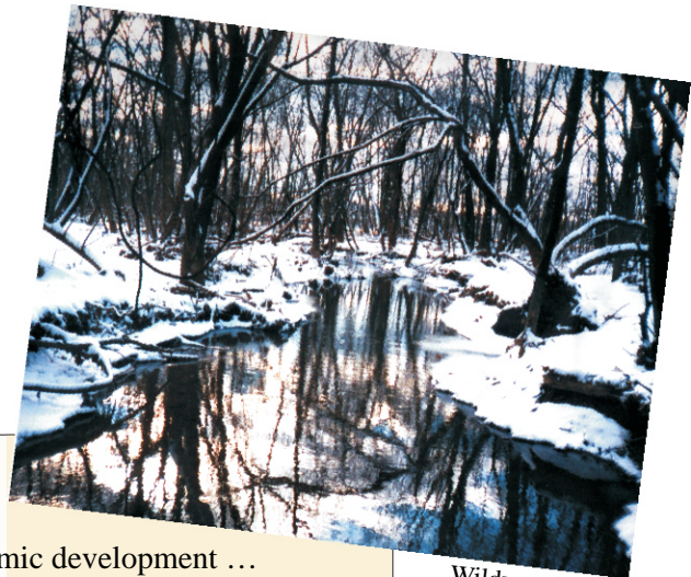
Wildwood Lake Sanctuary